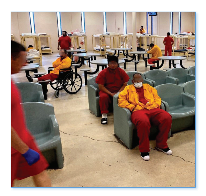
Figure 10. Some detainees in housing unit not wearing face masks on 10/20/2020

interviewed confirmed what staff told us — that they typically chose not to wear masks in their housing units but did so when outside the housing areas. 16