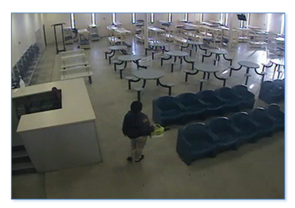
Figure 3. Hand foggers in use at Krome on 10/20/2020

demonstrated in Figure 4 at Karnes. In our observations of photos and video footage, the facilities we inspected appeared clean.