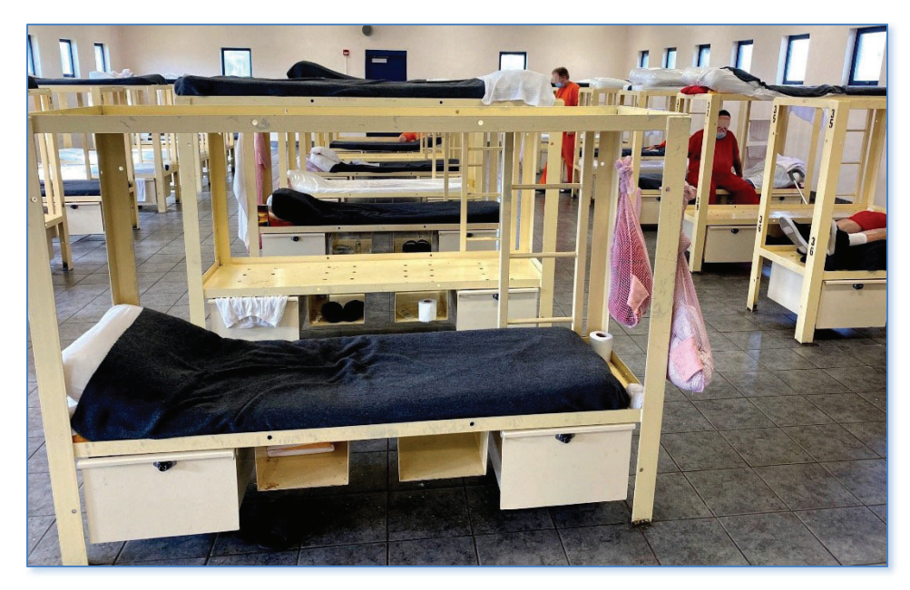
Figure 15. Beds configured to promote social distancing on 10/20/2020

Finally, we found facilities made efforts to increase social distancing when detainees were outside their housing units. For example, Karnes limited the number of families who could use the outdoor playgrounds and inside day rooms at the same time. At Karnes and Mesa Verde, recreation times in outdoor spaces were limited to detainees from the same housing unit to minimize interaction with detainees from other housing units.