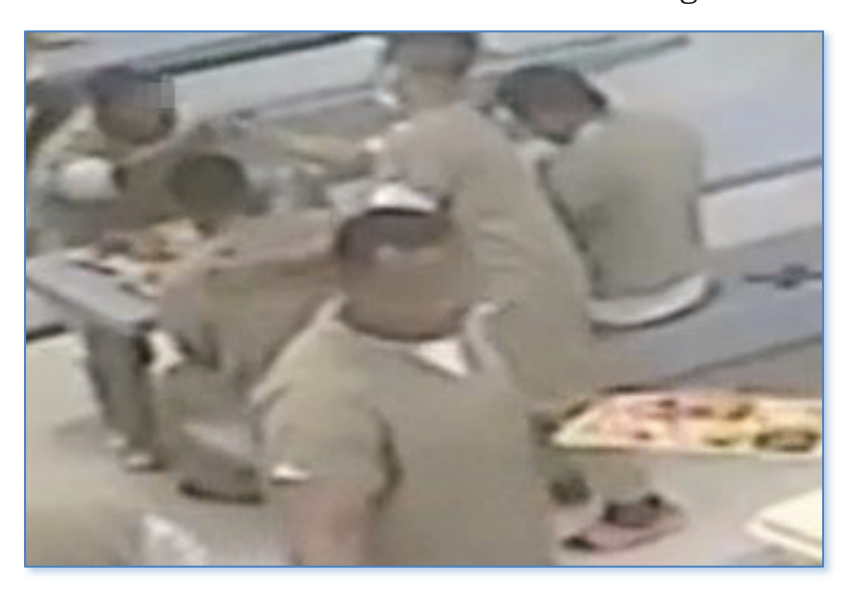
Figure 12. Lack of social distancing by detainees on 10/08/2020

and images, detainees who chose not to socially distance from each other, even when there was adequate space to do so and the furniture was clearly marked to promote distance between each detainee.<sup>17</sup> As with mask-wearing among detainees, ICE and contractor staff reported to us they could not determine and implement effective solutions to enforce social distancing.