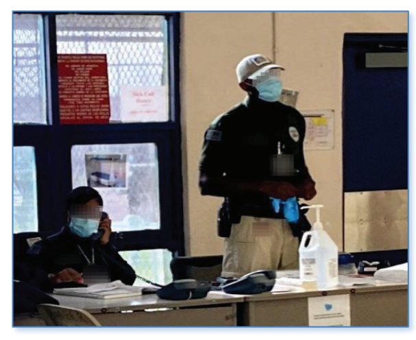
Figures 1 and 2. Hand sanitizer at detention officer stations at Krome on 10/20/2020