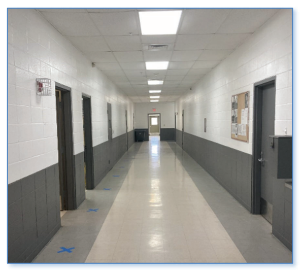
Figure 14. Floor marked to promote social distancing on 10/08/2020