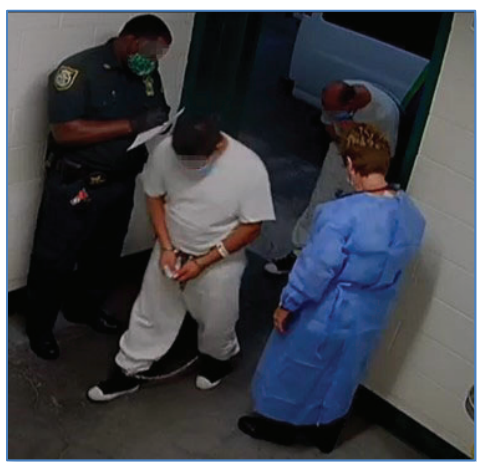
Figures 5 and 6. Pre-intake screening of detainees for COVID-19 at Glades on 10/10/2020

According to our interviews with staff, if at any time a detainee exhibited symptoms associated with COVID-19, the detainee was isolated to prevent the