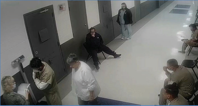
Figures 8 and 9. Medical staff walking the hall outside sick-call area and conducting medical screening on 10/08/2020