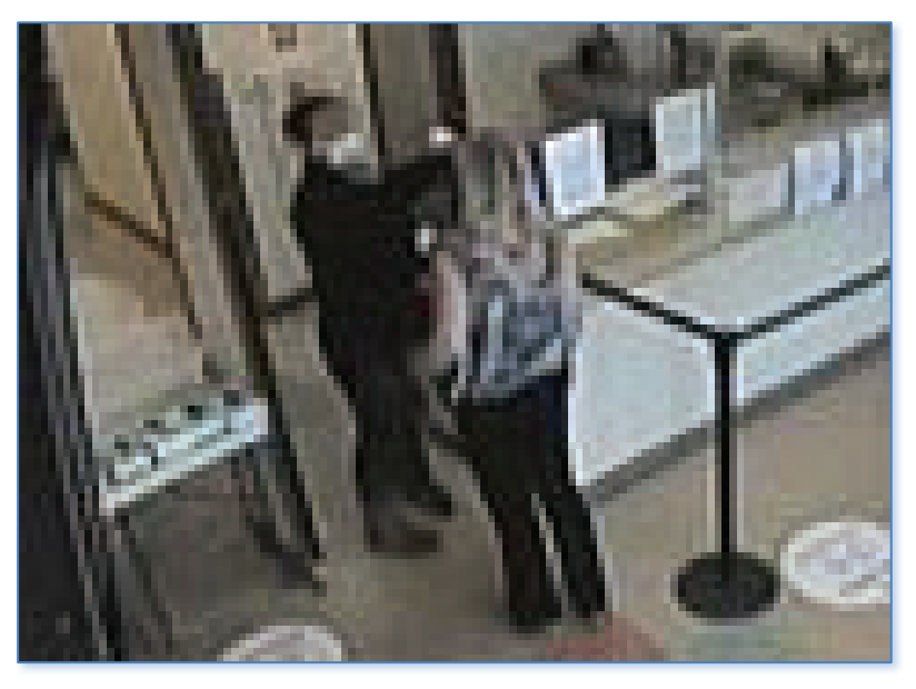
Figure 7. Temperature screening of facility staff on 09/22/2020

Additionally, we reviewed the screening processes for facility employees. Facilities reported that both ICE and contractor staff entering facilities underwent COVID-19 screening, including temperature checks twice a day and visual inspections for COVID-19 symptoms. We were able to confirm portions of the screening processes in some facilities as we observed employees entering facilities undergoing temperature checks through video and images. For example, at Adelanto, we observed temperature checks of some staff members in the lobby area as shown in Figure 7. We noted that not all individuals passing through the lobby checkpoint were temperature screened, but we cannot assess whether these people had already been screened prior to the video we reviewed. We observed the same screening processes at other facilities, including El Valle and Glades. We were unable to verify from videos whether facilities conducted verbal screening for staff.