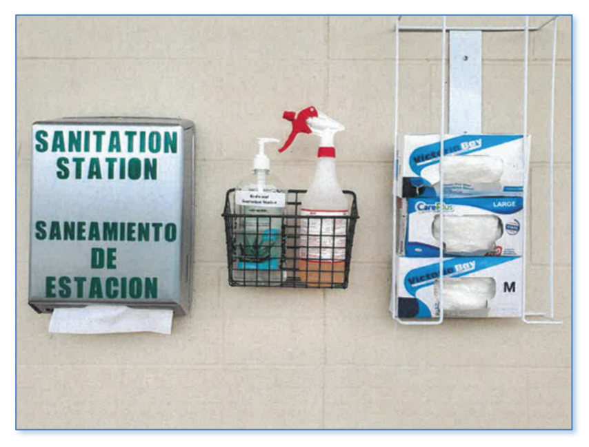
Figure 4. Cleaning and sanitation supplies for detainees in Karnes recreation areas on 10/8/2020